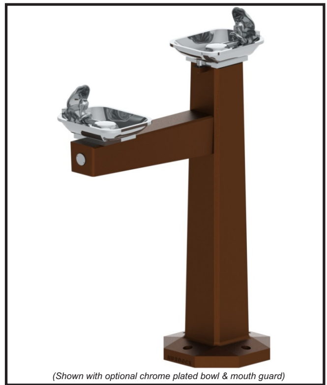
(Shown with optional chrome plated bowl & mouth guard)

All solid brass castings shall conform to ASTM standards B61 and B62. Unit is certified to ANSI A117.1, Public Law 111-380 (NO-LEAD), CHSC 116875 and NSF/ANSI 61, Section 9.