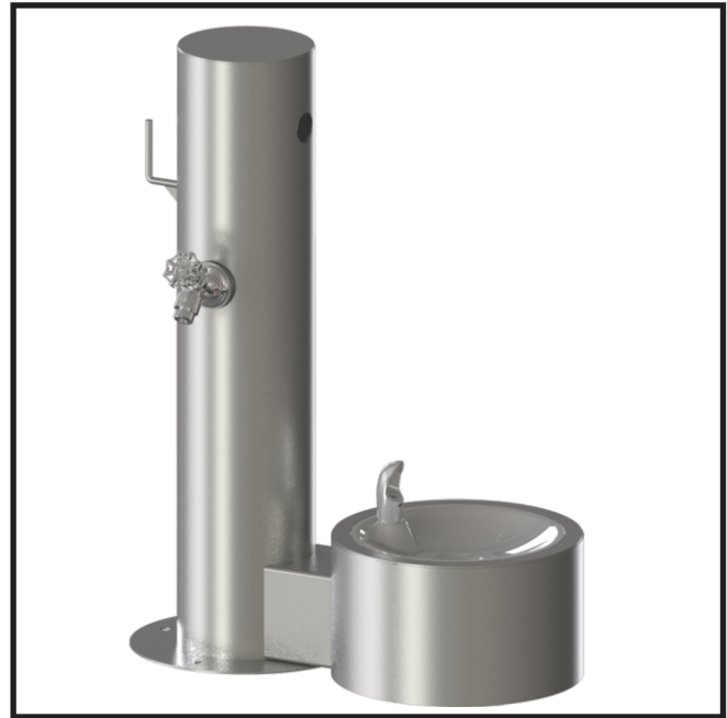
Model M-PM14 Shown

Unit shall be constructed of 14 gage type 304 stainless steel polished to a satin finish with 18 gage pet fountain bowl. Bottom plate shall be 3/16" thick and include three mounting holes with two additional mounting holes for pet fountain. 1/2" expansion anchor bolts shall be furnished. All other exposed fasteners shall be vandal resistant stainless steel screws.