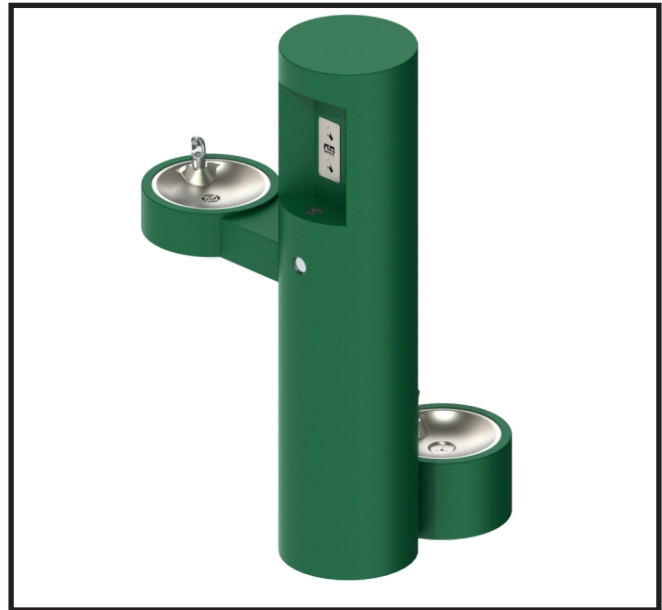
Model GYM75-PF Shown

2 This option is not available freeze-resistant.