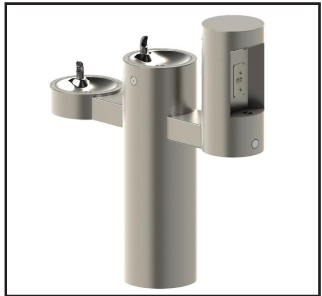
Model GYV34 Shown

Barrier-free drinking fountains with bottle filler shall be Murdock model GYV34. Construction shall be 12 gage, all stainless steel with 18 gage stainless steel fountain bowls. Pedestal base shall have four mounting holes. Access covers shall be secured with vandal-resistant stainless steel screws. Bottle filler shall be activated by a 9-volt sensor or a pushbutton as standard and provide 1.0 GPM flow. Unit shall contain a 100-mesh inlet strainer, lead and cyst filter, 6-AA battery pack and laminar flow spout. Self-closing pushbutton, needing less than 5 pounds of force, shall activate internally mounted valves with adjustable stream regulators. Bubblers shall be stainless steel with non-squirt feature and operate on water pressure range of 20-105 PSIG. Fountain is certified to ANSI A117.1, Public Law 111-380 (NO-LEAD), CHSC 116875 and NSF/ANSI 61, Section 9. Fixture meets ADA requirements when mounted appropriately.