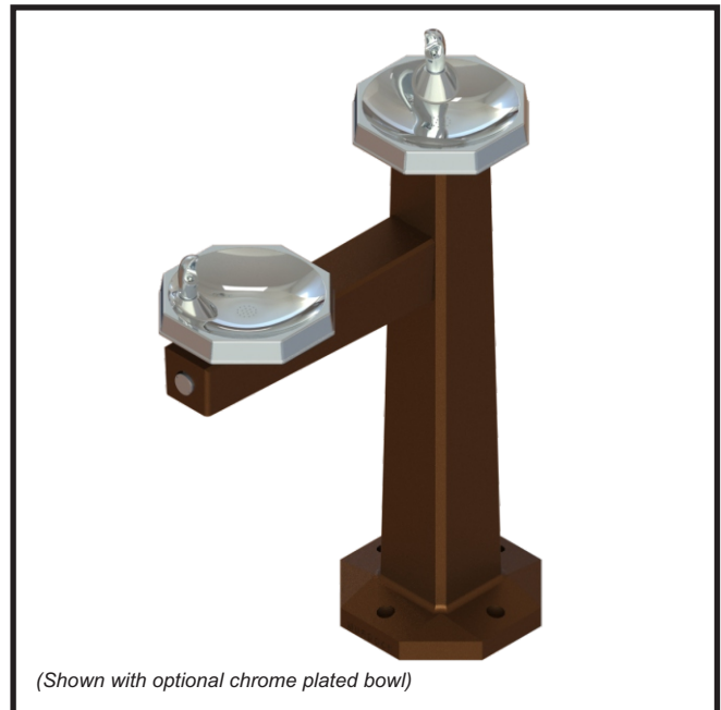
(Shown with optional chrome plated bowl)

All solid brass castings shall conform to ASTM standards B61 and B62. Unit is certified to ANSI A117.1, Public Law 111-380 (NO-LEAD), CHSC 116875 and NSF/ANSI 61, Section 9.