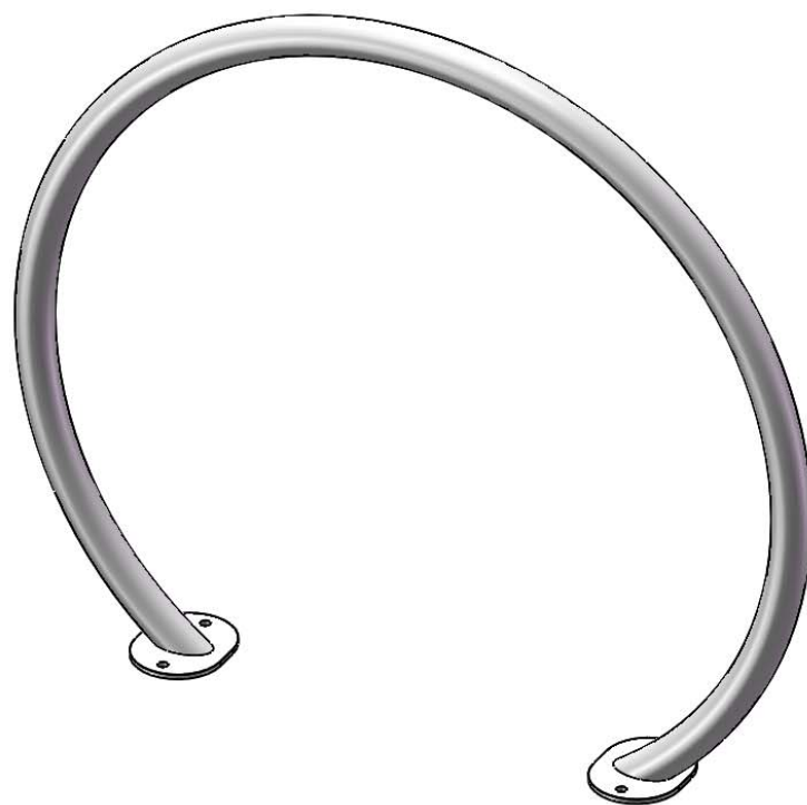
Model # 5000SM