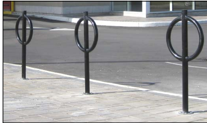
Surface Mount Model Shown: PMBR-P-SM (Painted)

In-Ground Model: PMBR-P-IG (Painted) PMBR-G-IG (Galvanized)