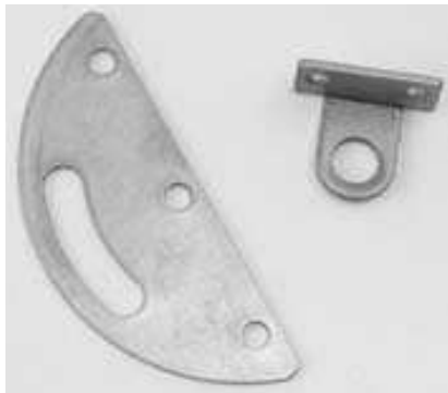
The recommended padlock is the PC-000205M sold separately.

The LK04 -1000 Door Lock Kit is designed to be used with most portable restrooms. This kit can be mounted anywhere along the non-hinged side of the door and door jamb. The hasps are made from stainless steel and the rivets are aluminum, assuring a no rust maintenance free long life. Fasteners supplied with kit are designed to be used with doors made with steel pillars and jambs of aluminum. Alternative fasteners may be necessary if used with doors and jambs made of other construction.