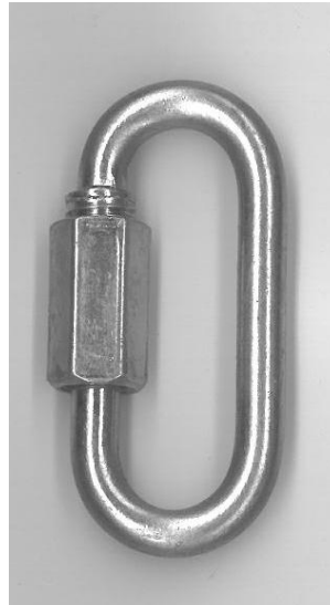
1/4" QUICK LINK