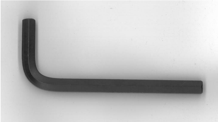
5/16 ALLEN WRENCH (RED BAG)