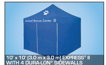
10' x 10' (3.0 m x 3.0 m) EXPRESS® II WITH 4 DURA-LON® SIDEWALLS