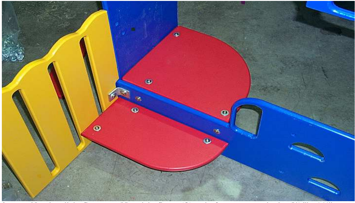
9. Now install the flower pot (N) and the flower (O) to the front entry panel using 5/16" x 1 <sup>1</sup>/<sub>2</sub>" button head bolts, 5/16" x 1" button head nuts, 5/16" flat washers, and 3/8" flat washers.

8. Next install 2 corner brackets to the upper 2 holes in the lower side panel (C) and 1 corner bracket in the lower hole of the front entry panel (D). These brackets will support the large step (H). Once these brackets are install place the small step (I) on the corner brackets from step 7 and install the large step on the remaining 3 corner brackets. Tighten all hardware on this corner.